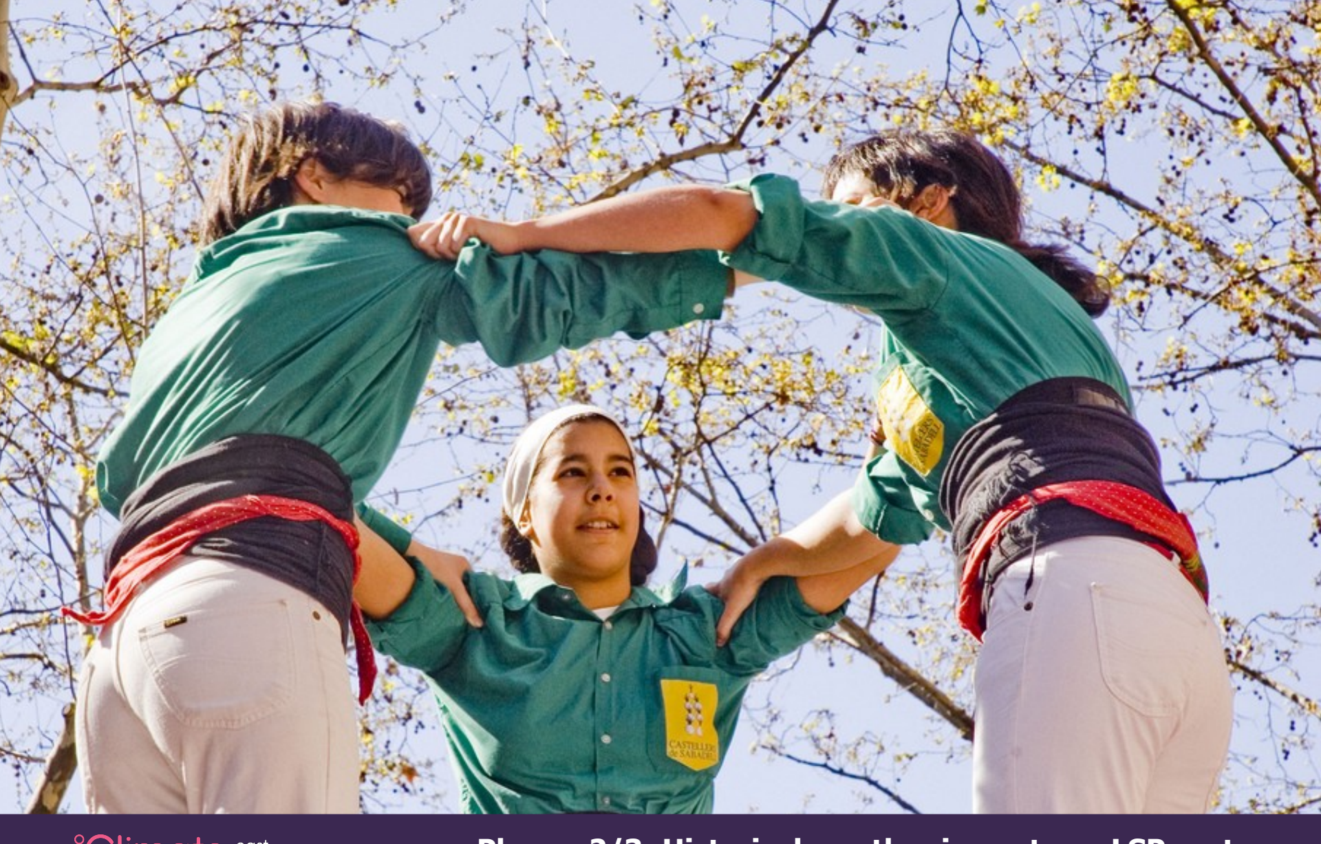
°Climate east midlands